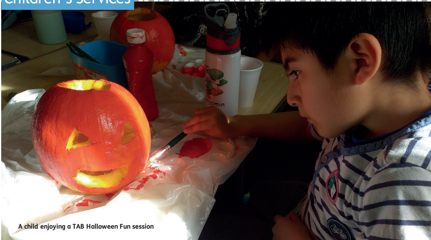
A child enjoying a TAB Halloween Fun session

In June we began our Parenting helpline which is a booked telephone service to discuss parenting issues and offer advice and strategies with a follow up email.