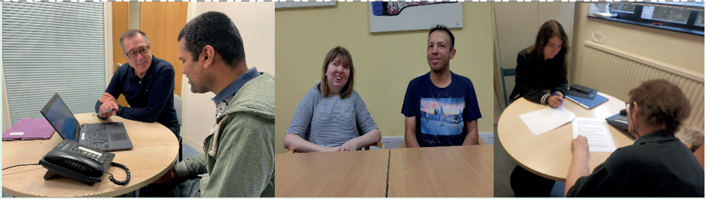
Right & left: Working For You have been supporting clients with forms and applications Centre: Engagement have been hearing from service users about their experience of our service

We provide essential information, advice, and guidance to our clients on a wide range of issues that they may need help dealing with.