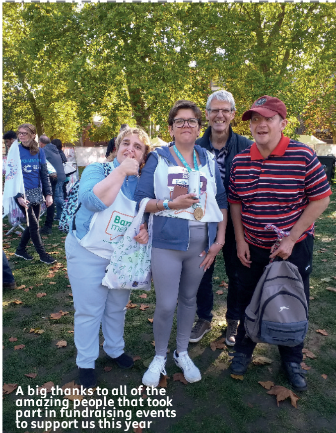
A big thanks to all of the amazing people that took part in fundraising events to support us this year