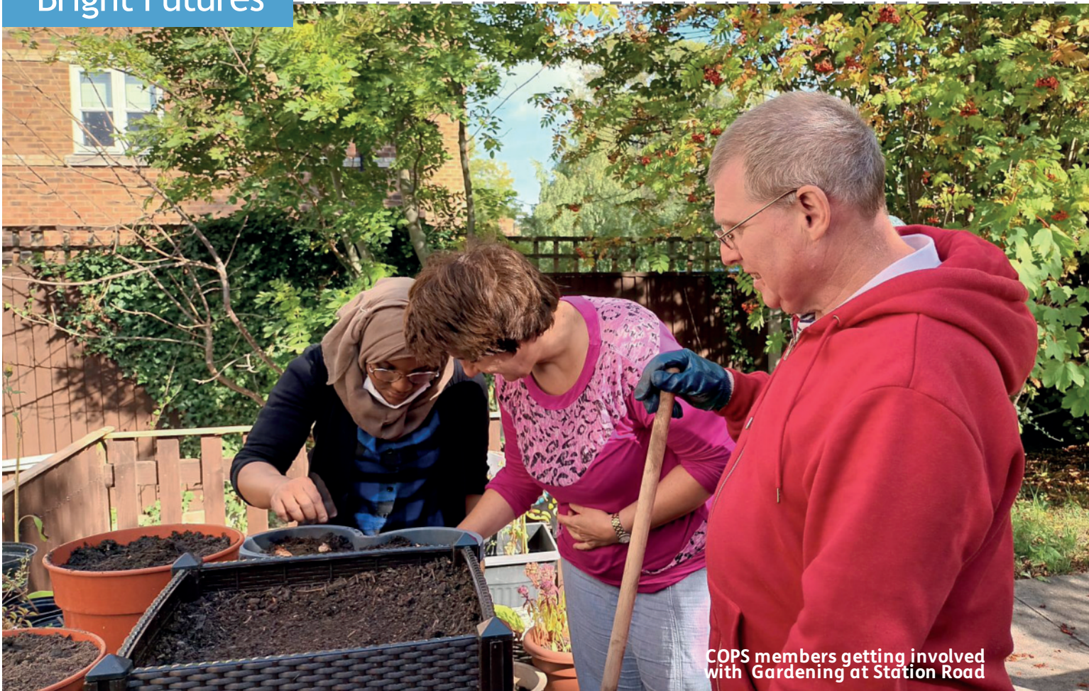
COPS members getting involved with Gardening at Station Road

Bright Futures is made up of ‘COPs’, ‘Working for You, the Employment project, Engagement work, and Project 300.