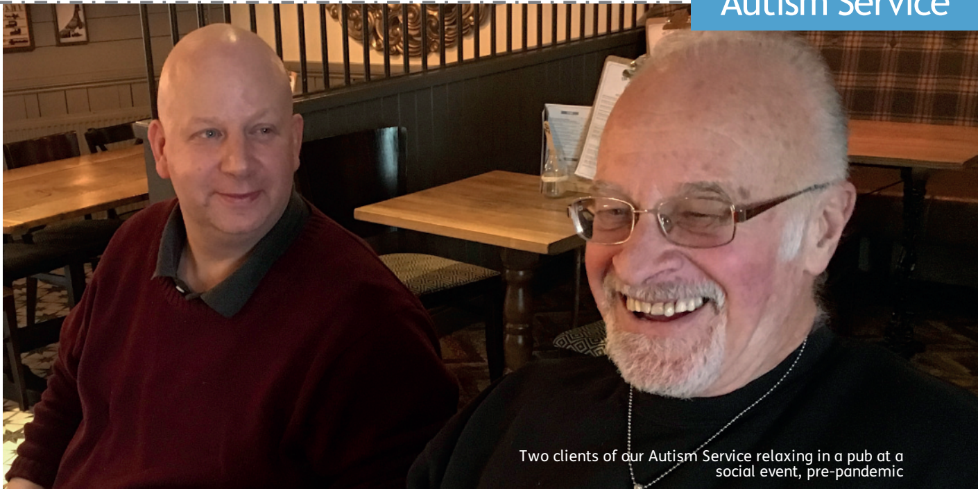
Two clients of our Autism Service relaxing in a pub at a social event, pre-pandemic

The Autism Service has continued to deliver information, advice and support to adults with autism in Barnet.