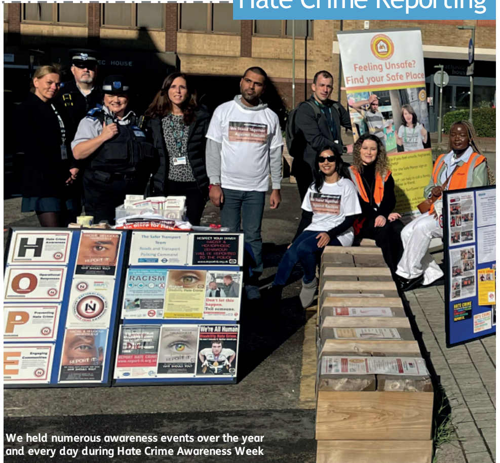
We held numerous awareness events over the year and every day during Hate Crime Awareness Week

Hate Crime Reporting Project supports vulnerable adults to identify and report all strands of hate crime, including people who are targeted because of disability or mental health conditions, race, religious and faith hate crime and anti-LGBT hate crime.