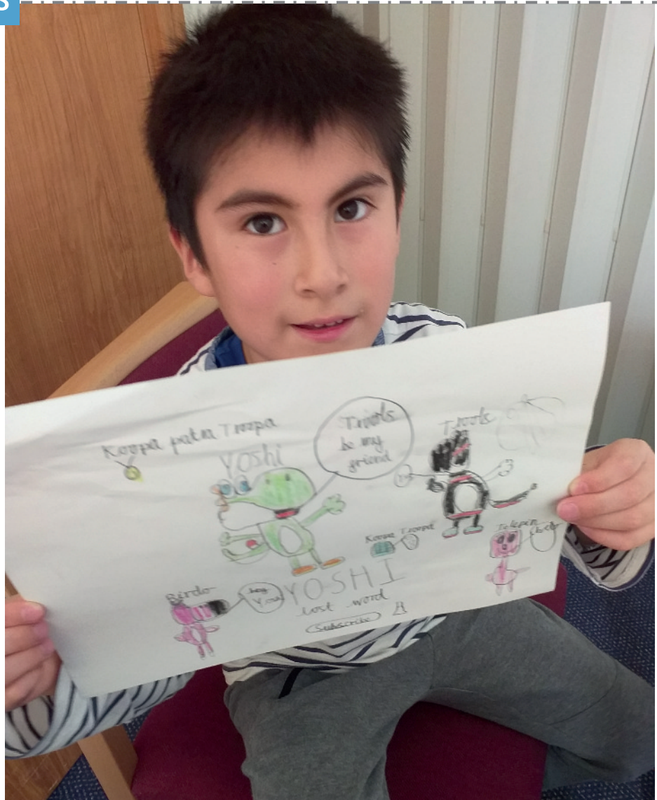
A child at one of our Take A Break creative activity sessions

Children's Services support parents of children and young people with additional needs with Information, Advice and Guidance (IAG), workshops and parenting programmes. Through Take a Break (TAB), we also offer short breaks for children and