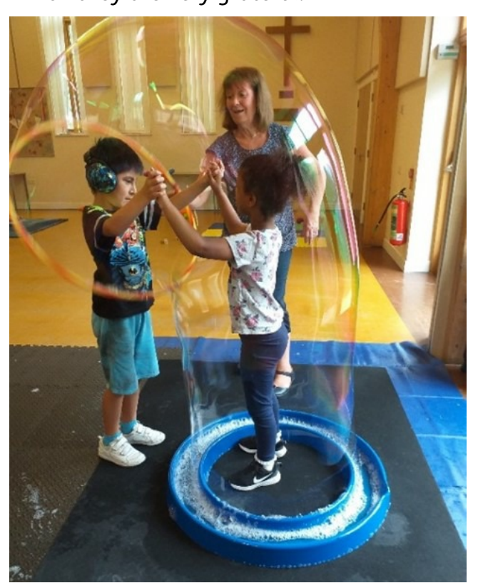
Children playing at a Take a Break session

Take a Break have continued to support young children living in Barnet with learning disabilities to have fun during their half term breaks in 2022/23. The breaks have given their parents some respite time, for which they are very grateful.