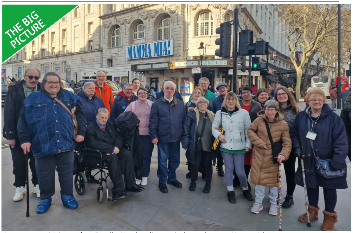
Here we go again! Some of our Equality Housing clients enjoying a trip to see Mamma Mia!