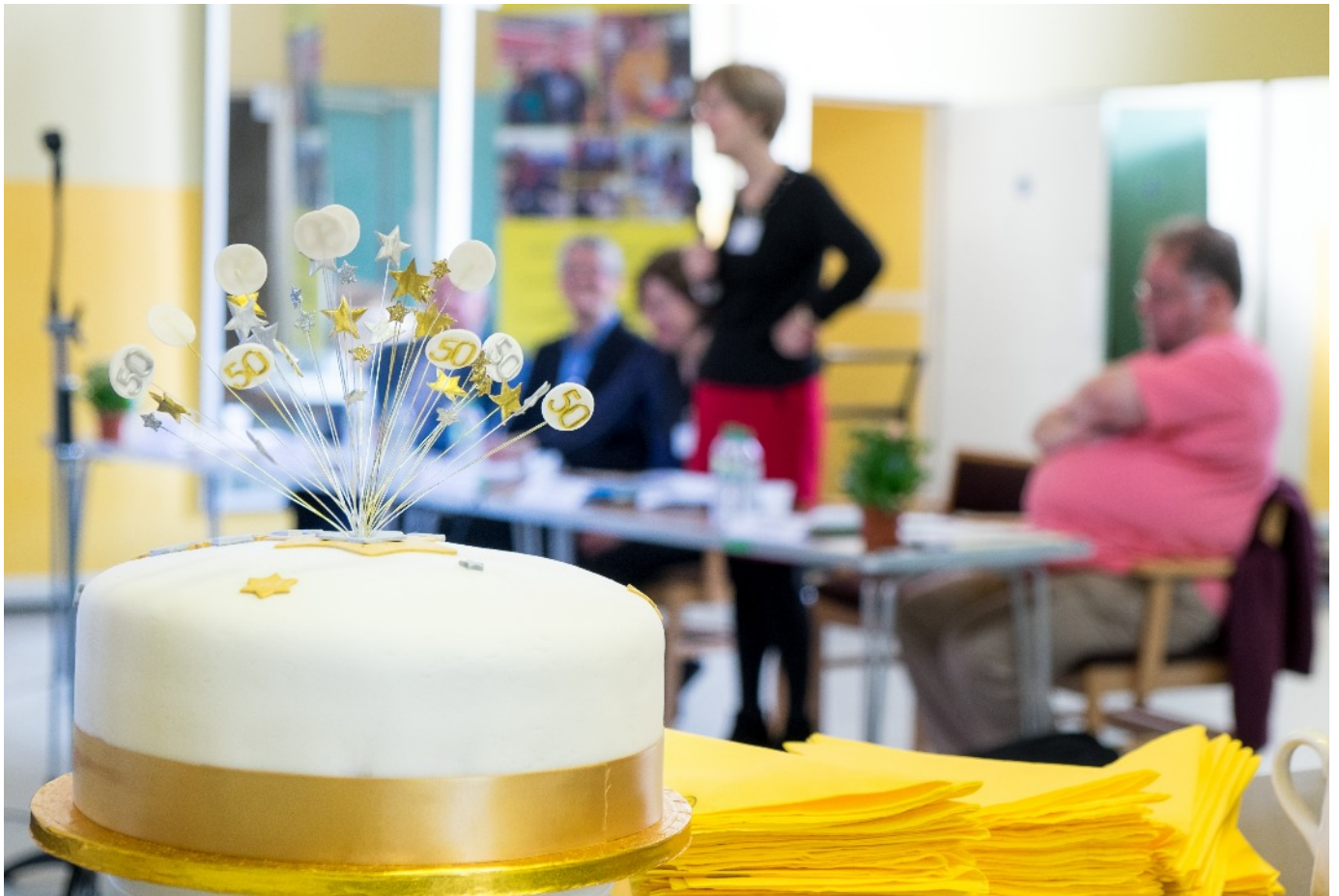
A cake to celebrate our fiftieth anniversary, which was enjoyed by those who came to our AGM.

In 2015, Barnet Mencap has celebrated its 50 th anniversary. The book to mark the first fifty years of Barnet Mencap, 'From Backward Children to Bright Futures,' was launched at the AGM on 4 th November. It is available to buy (see the back page for details).